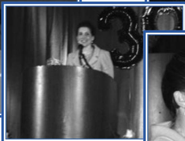
Miss America speaks on overcoming disabilities