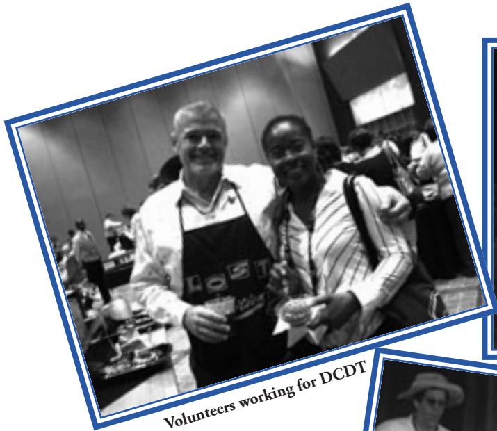
Volunteers working for DCDT