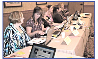
MO-DCDT provided DCDT conference information to attendees of the fall training session for Missouri Transition Liaisons.