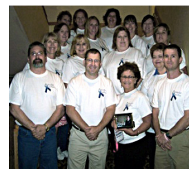
MO-DCDT members and Missouri Transition Liaisons support a colleague who is battling cancer. The picture was taken during the MO-DESE 2010 Summer Institute.

The Missouri University Thompson Center for Autism and Neurodevelopmental Disorders is developing a website, Transition Roadmap to the Future: Transitioning into Adulthood with ASD .